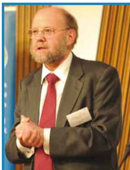
Professor Sir Ian Wilmut speaks at the Scottish Parliament

One very positive example of the effect of these media stories was when the Welsh Assembly Government finally granted confirmation to patients with Laurence Moon Bardet-Biedl Syndrome (LMBBS) that they would be funded to access a new National Commissioning Group service in England. Following a two page spread that we secured in the Western